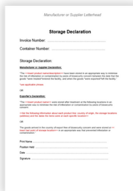
Storage Declaration Sample