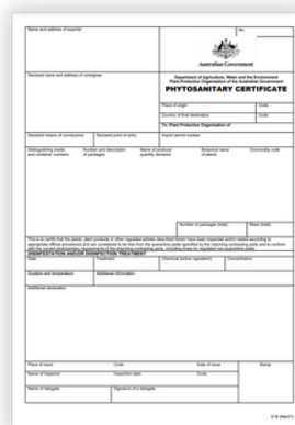
Phytosanitary Certificate Sample