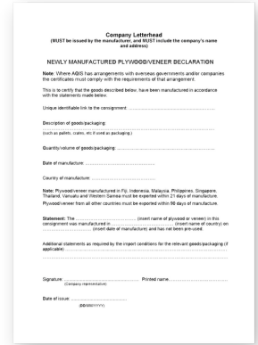
Newly Manufactured Plywood Declaration